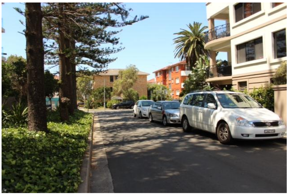
Parking along Ozone Street