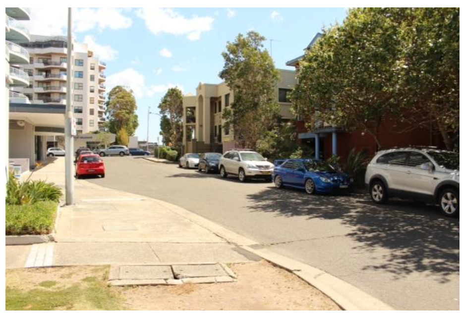
Parking along Ozone Street

I have noticed that recently approved developments within the neighbourhood may provide sufficient on-site parking for residents, but do not provide adequate on-site parking spaces for visitors to both the residential and retail components. There is already a delicate balance that exists in Ozone, Gerrale and McDonald Streets in terms of the availability of street parking; however with larger developments being permitted by Council, this will result in an untenable demand for parking.