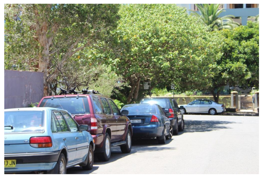
Parking along Ozone Street